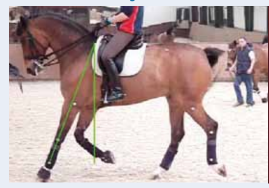
By striking a vertical 'control' line and measuring and comparing the angles of extension with the...